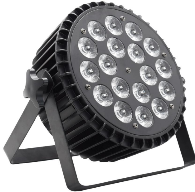
Model: BC-HP18F 18x6in1 Led Par Light